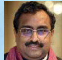
Shri Ram Madhav Member, National Executive, Rashtriya Swayamsewak Sangh and Member, Board of Governors, India Foundation, India